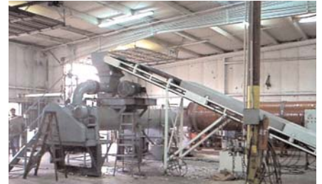
BouldinCorp's WastAway Recycling System.

The Fort Campbell study was conducted during 2001-2003 using application rates up to 16 tons of fluff per acre. Plant species composition, cover, biomass, and soil physical and chemical analyses were performed