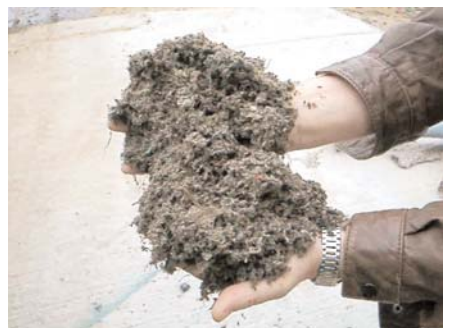
Organic material, or fluff, produced by the WastAway System.