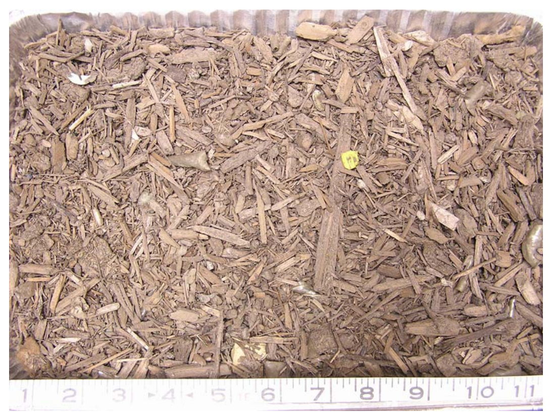
Figure 11. Test material processed at 150° C.