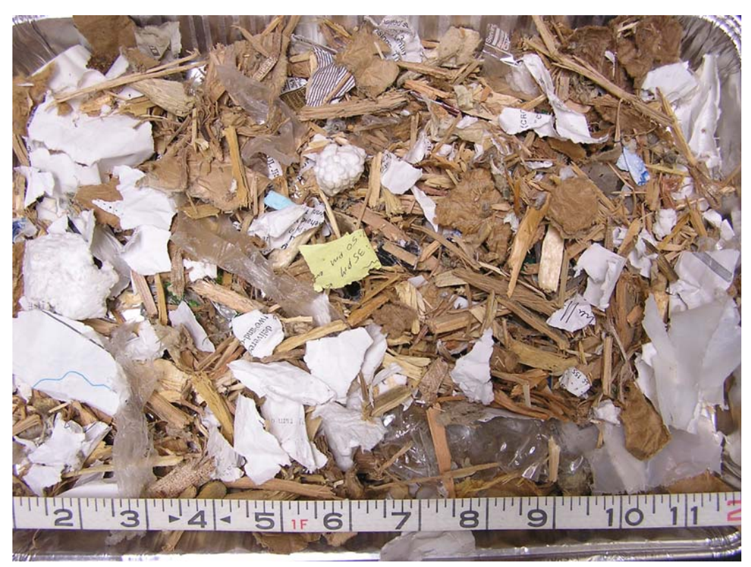
Figure 8. Unprocessed test material. This waste was shredded again in the lab to further reduce particle size prior to being placed into the reactor vessel.