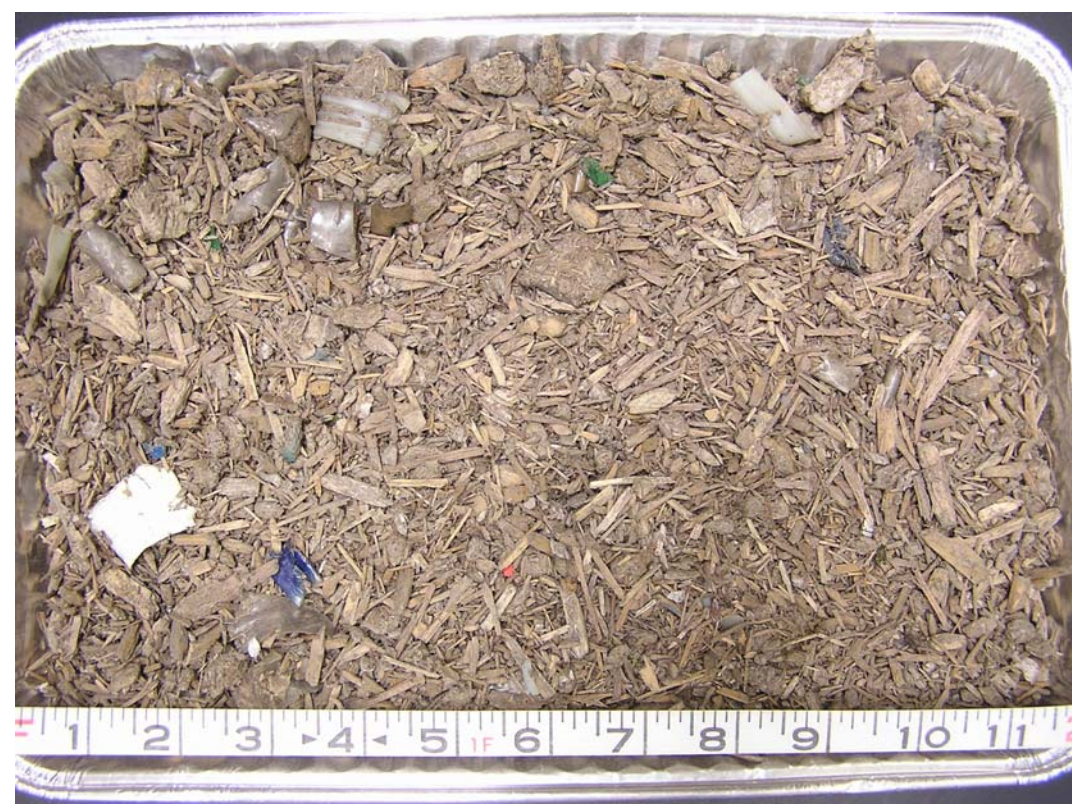
Figure 10. Test material processed at 120° C.