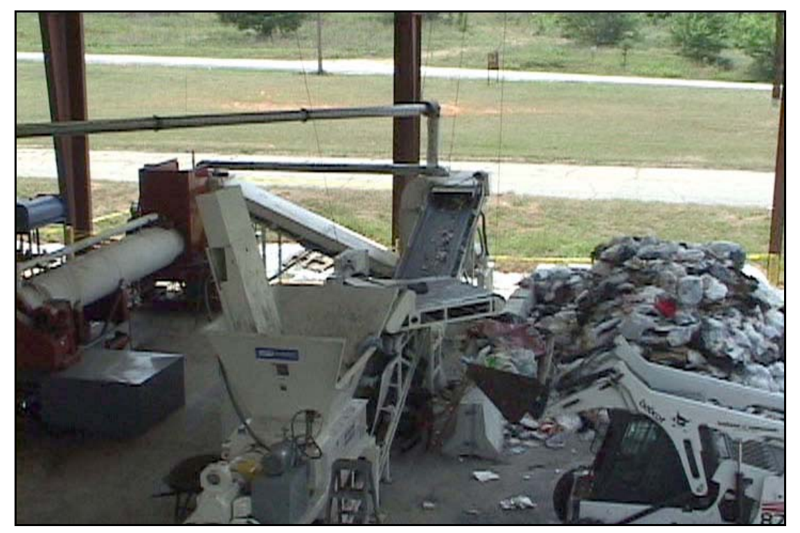
Figure 4. Bouldin processing system used during Fort Benning demonstration. A Bobcat is loading initial shredder with domestic waste from pile on right. Shredder is followed by metal removal, a second shredder, grinder, and hydrolyzer (on left).

In Fiscal Year 2001 an ERDC-CERL project to validate use of the Bouldin system on Army installations was funded by Congress. ERDC-CERL then contracted the National Defense Center for Environmental Excellence (NDCEE) to conduct a pilot-scale demonstration of the Bouldin system at Fort Campbell for 1 week in June 2001. This effort was followed by a second NDCEE pilot-scale demonstration conducted at Fort Benning over a 3-week period in June/July 2002. Figures 4 and 5 show much of the equipment used during the Fort Benning evaluation. Refuse from family housing areas was used as the input test material.