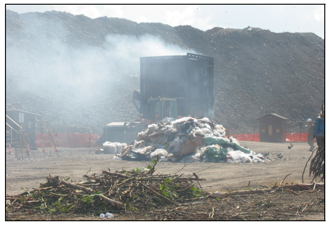
Figure 1. Smoking air curtain incinerator at a U.S. camp in the Balkans. The pile of material behind the incinerator is accumulated residue from the incinerator.

the technology was determined to be too energy intensive for deployment. This report discusses laboratory-scale experiments, an alternative energy source study, and an economic analysis to determine whether the hydrothermal process can be made deployable.