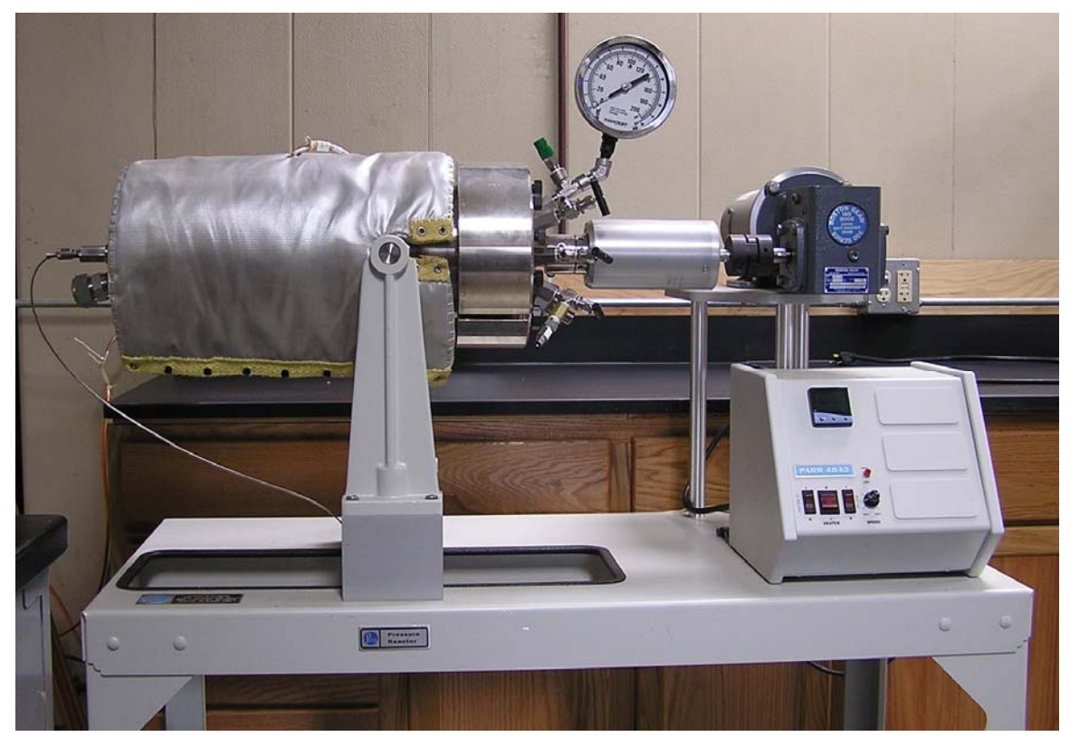
Figure 7. Parr reactor vessel used to mimic conditions inside hydrolyzer. Test material was kept at a set temperature within the heat-jacketed vessel on the left, while being constantly stirred by the motor on the right.