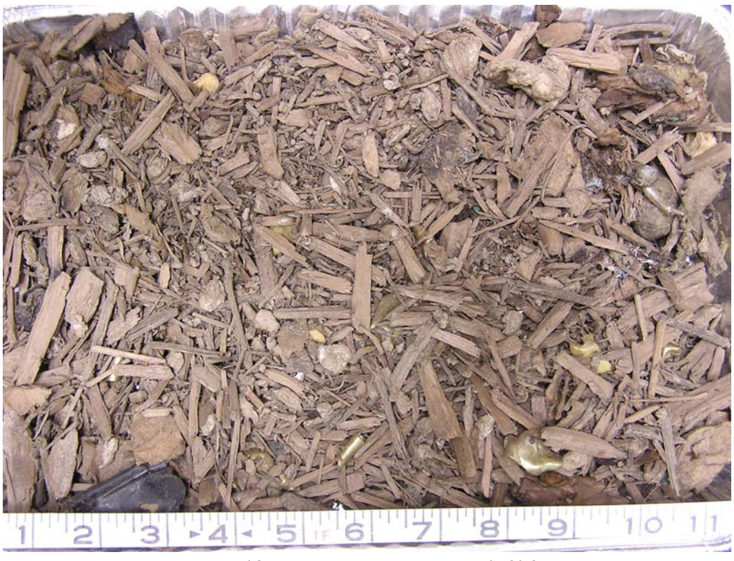
Figure 12. Test material processed at 170° C.