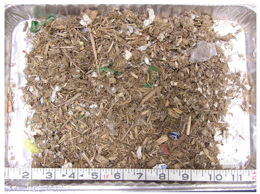
Figure 9. Test material processed at 70° C.