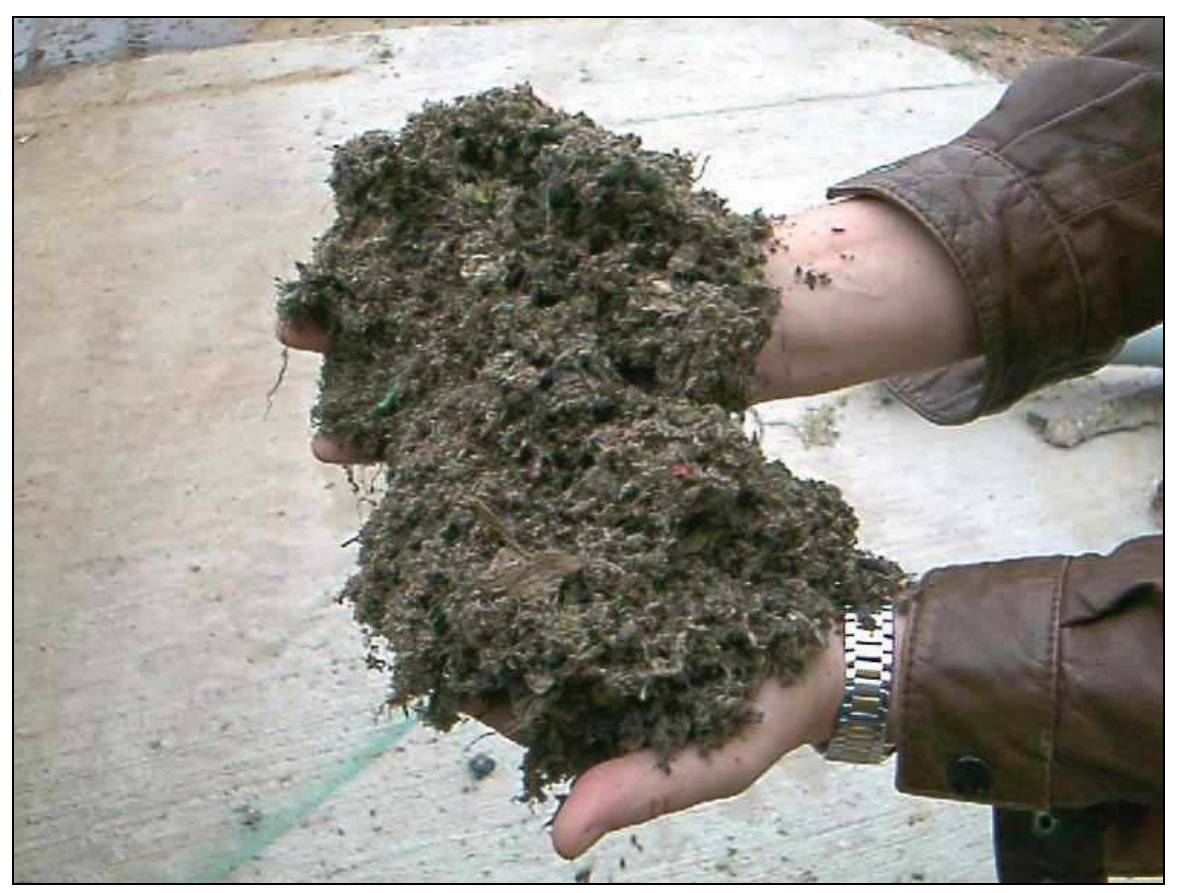
Figure 6. Processed waste from Fort Benning demonstration.

Chemical analysis of the fluff confirmed the processed waste was not a characterized hazardous waste, and analysis of air samples for particulate matter and volatile organic compounds showed that the Bouldin system generated no air pollutants of concern. The system evaluation showed that it was fairly expensive to operate and maintain, and was not competitive with disposal by conventional sanitary landfill at most continental United States (CONUS) installations. The power requirements for the shredders, grinder, and especially the steam generator made the system energy intensive. Improvements Bouldin has made to the system since these demonstrations have made the system more efficient, however.