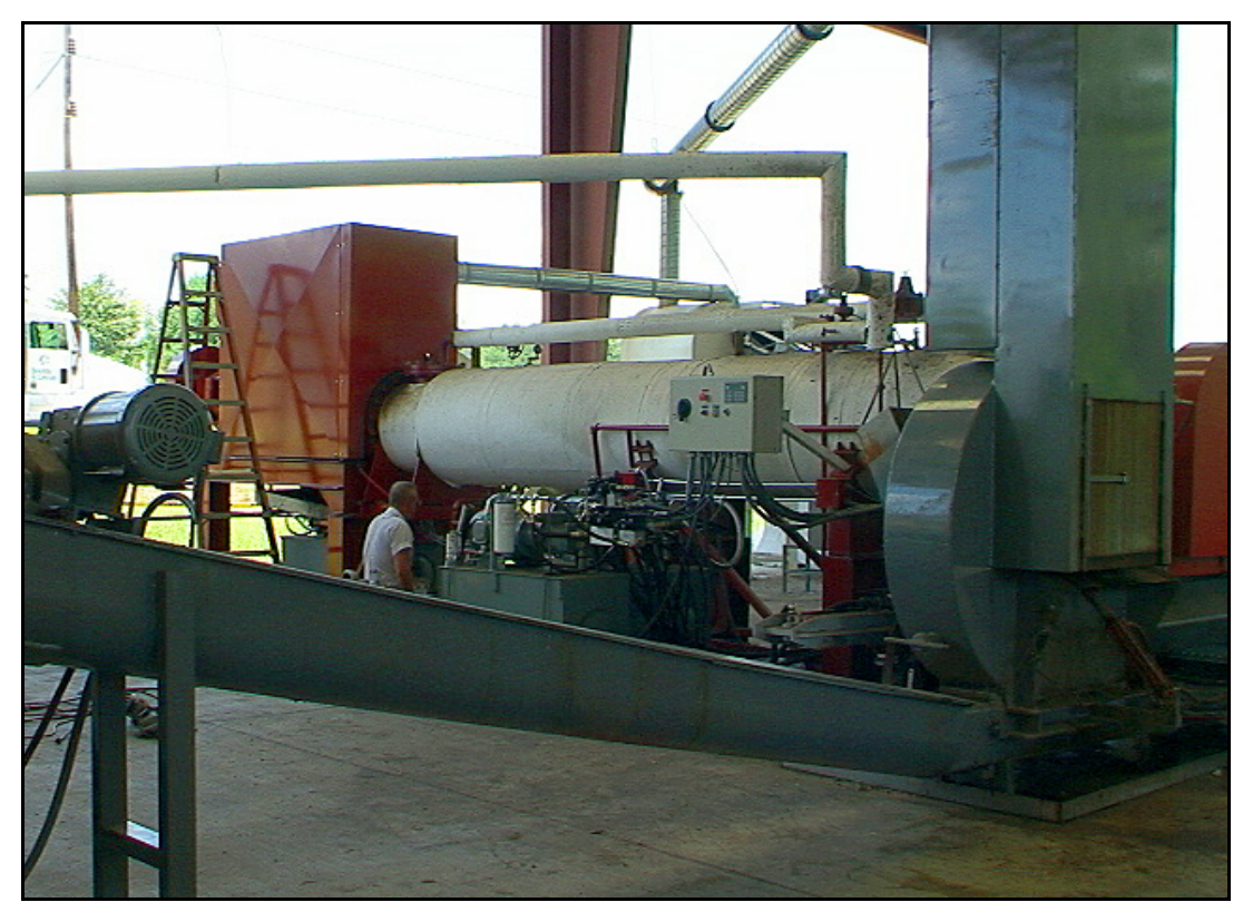
Figure 5. Hydrolyzer component of Bouldin Corp. processing system. Waste flows left to right through white cylindrical pressure vessel, then exits hydrolyzer into the auger chute (bottom right).

Three overall objectives were associated with these demonstrations: