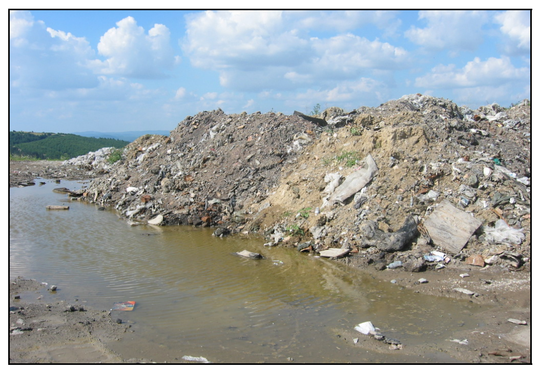
Figure 2. Pile of incombustible material removed from air curtain incinerator. This material accumulated near the base camp due to lack of final disposal site.